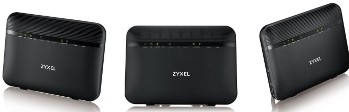
Zyxel VMG8924-B10D AC1600Mbps Router £ 105.00 + V.A.T. (£126.00 inc.) See Picture Above Openreach Approved Dual Band AC1600 ADSL2/VDSL2 Modem / Router with built in 4 x 1000Mbps Network Switch (Wireless AC1600Mbps Router with VDSL2 Modem + dedicated WAN port / VoIP / USB Sharing / 3G Backup)