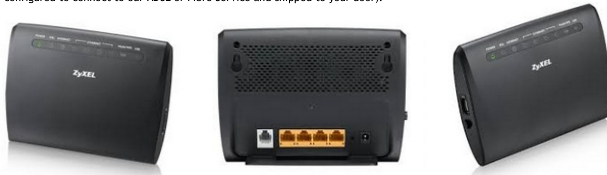
Zyxel VMG1312-B10D N300Mbps Router £ 58.00 + V.A.T. (£69.60 inc.) See Picture Above Openreach Approved N300 ADSL2/VDSL2 Modem / Router with built in 4 x 1000Mbps Network Switch (Wireless N300Mbps Router with VDSL2 Modem + dedicated WAN port / USB Sharing / 3G Backup)

(Pre-configured to connect to our ADSL or Fibre Service and shipped to your door).